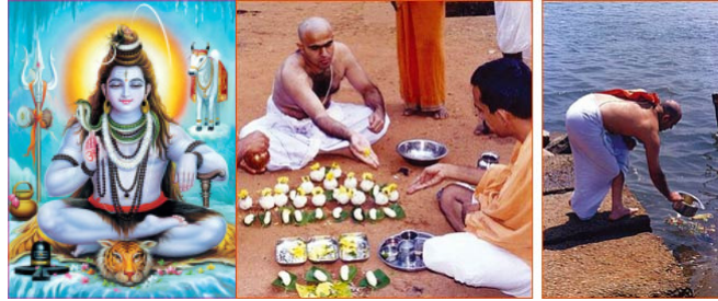
AMAVASYA THARPANA SANKALPA MANTRA - 2008 - 2009 Includes Mahalayapaksha Mantra, Sankalpam performance for each Amavasya

Home Pooja About Pradosham Scripts Saints What's New Why we Celebrate Temples Photo Gallery Downloads About us