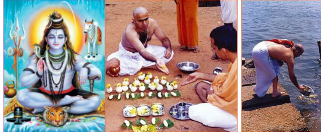
AMAVASYA THARPANA SANKALPA MANTRA - 2010 - 2011 Includes Mahalayapaksha Mantra, Sankalpam performance for each Amavasya - Vikruthi

Home Pooja Scripts About Pradosham Saints Mahashivarathri Temples Photo Gallery Downloads About us